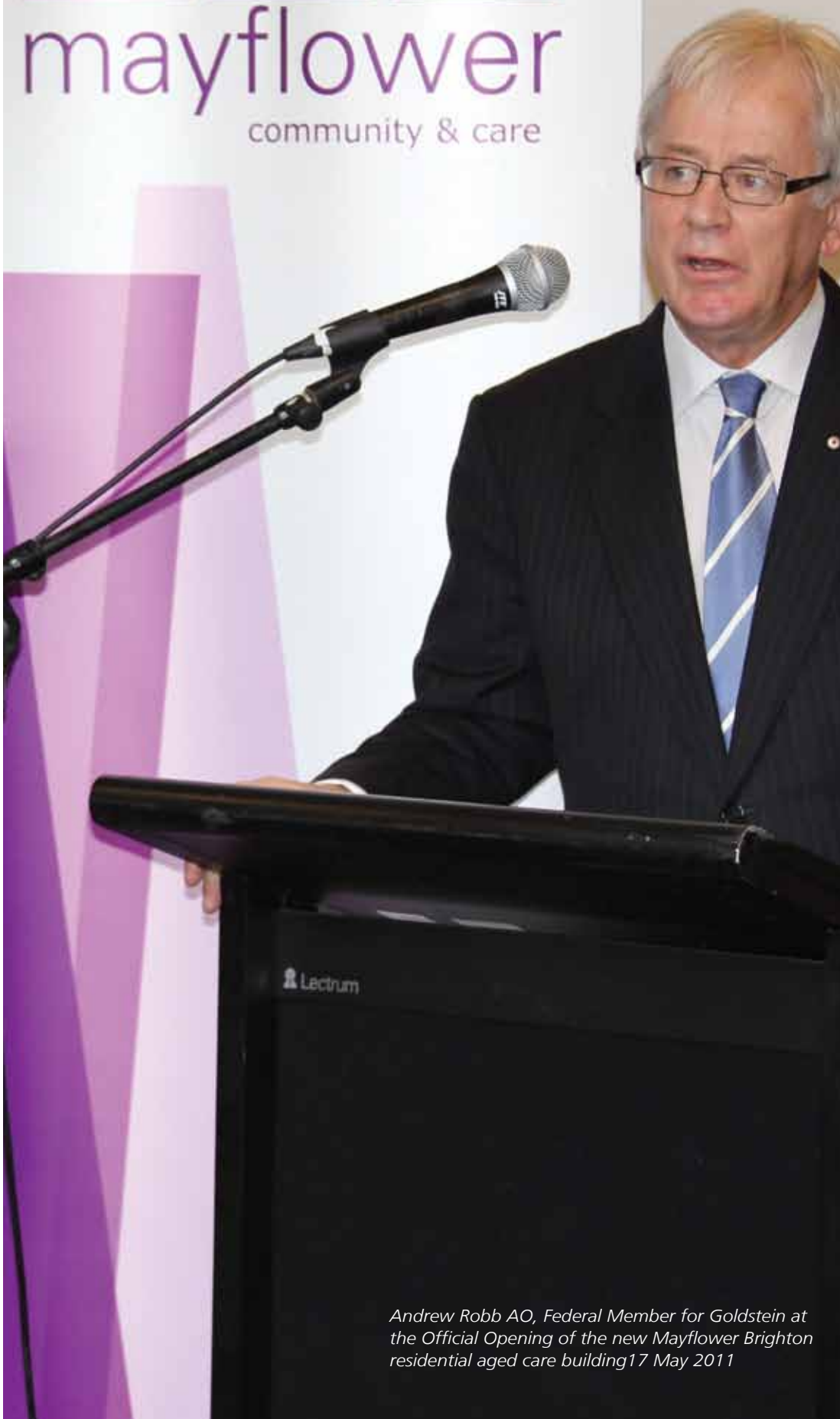
Andrew Robb AO, Federal Member for Goldstein at the Official Opening of the new Mayflower Brighton residential aged care building 17 May 2011