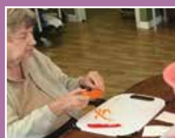
Cooking up a storm!