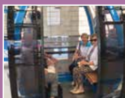
Residents extend their independence