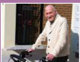
Celebrating a special Centenarian