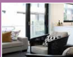
Rodda Dixon Terraces selling fast!