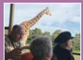
A day in the wild