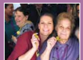
Some Olympic winners at Reservoir