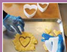
Special celebration cookies with love