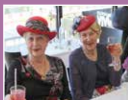
Hats on for Oaks Day fun!