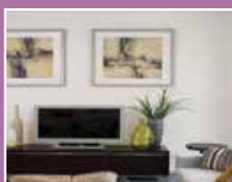
Rodda Dixon opens to residents