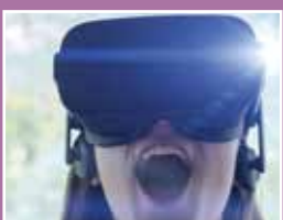
A technology trial worth considering